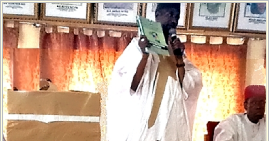
Secretary to Kaduna State Government Launches New Local Government Scheme of Service

The Local Government Service Commission is intensifying efforts to lay a solid foundation for effective workforce management in the 23 local governments. The Commission has recently introduced a new Scheme of Service for the unified Local Government Service.