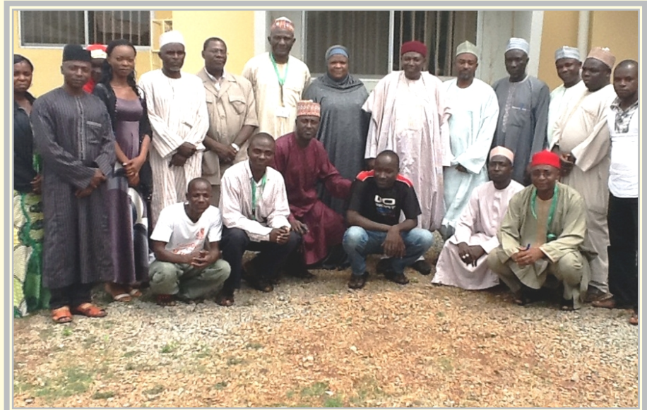
Head of Service and entourage with Staff of BPSR after a familiarization visit