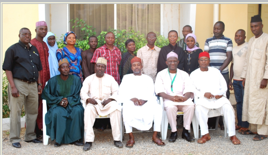
Permanent Secretary BPSR & Staff

To respond to the decaying roads asset of the State, the Kaduna State Government supported by World Bank—KADRAMP organized a workshop to develop a Road Transport Policy that will address among other things, roads asset maintenance and management.