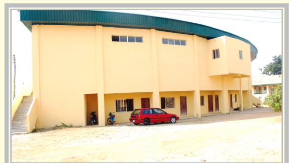
New Lecture Theatre at Staff Development Centre

"Progress is impossible without change, and those who cannot change their minds cannot change anything" – G.B Shaw