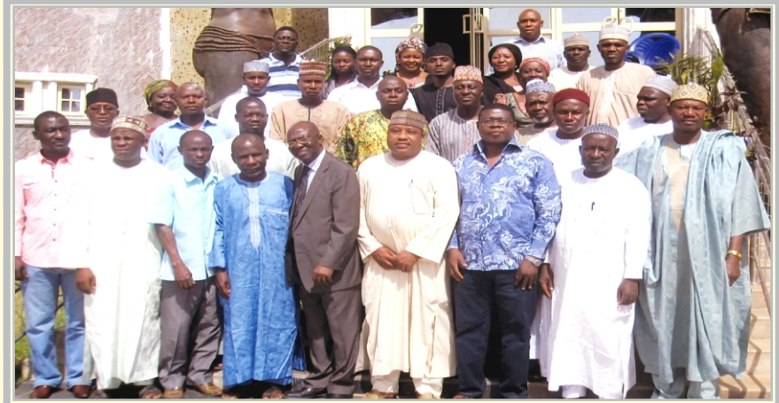
Task Team on Corporate Planning

Kaduna State Government had conducted a verification exercise (including a biometric data capture) which is aiding effective manpower planning and development. The report of the exercise reveals an ageing service where about 60% of serving officers are 40