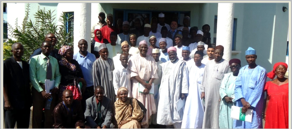
Participants at the workshop on KDS Business Climate facilitated by DFID-GEMS3

To engender the right business climate in Kaduna State, a workshop to evolve a Public Private Engagement Mechanism was conducted for stakeholders. The workshop was supported by DFID's Growth and Employment in States (DFID-GEMS3).