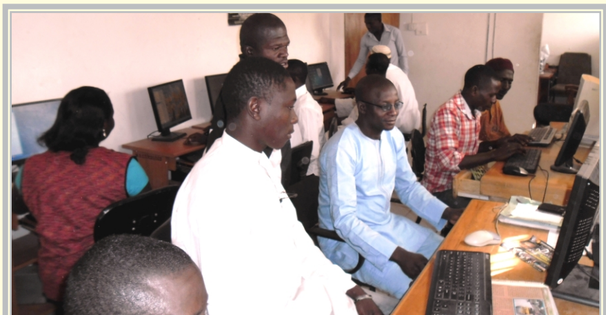
ICT Training Session at Ministry of Science & Technology

total annual personnel costs for capacity development. With this great investment in human capital development, Kaduna State is poised to realize the vision of its public service of “a professional, motivated, ethical and well-resourced public service in Kaduna State positioned to effectively and efficiently deliver quality services in a responsive and accountable manner”.