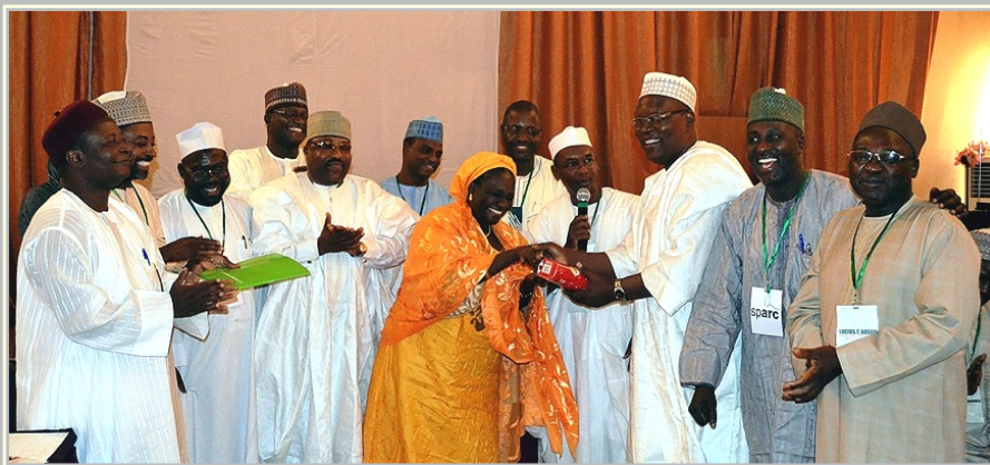
Kaduna State Contingent Celebrating Governance Share Fair Award – Abuja

Kaduna State participated and emerged the overall winner of the Governance Share Fair held in Abuja where States enjoying DFID support in Northern Nigeria showcased their achievements in reform programmes implementation.