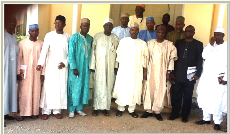
Participants at the workshop on KDS Business Climate facilitated by DFID-GEMS3

Highlights of the visit included questions and answers sessions on the structure of reforms in Kaduna State; process leading to the establishment of Kaduna State BPSR; level of reforms implementation; mandates mapping, funding of BPSR; Political support; and the roles played by Development Part-