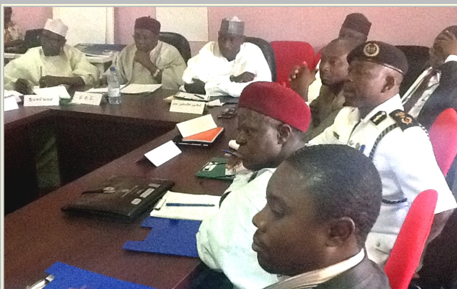
HoS (2nd Left) with some Participants at a Workshop on KDS Road Transport Policy

Kaduna State participated and emerged the overall winner of the Governance Share Fair held in Abuja where States enjoying DFID support in Northern Nigeria showcased their achievements in reform programmes implementation.