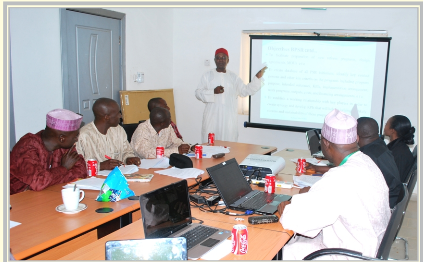
In-House Training Session