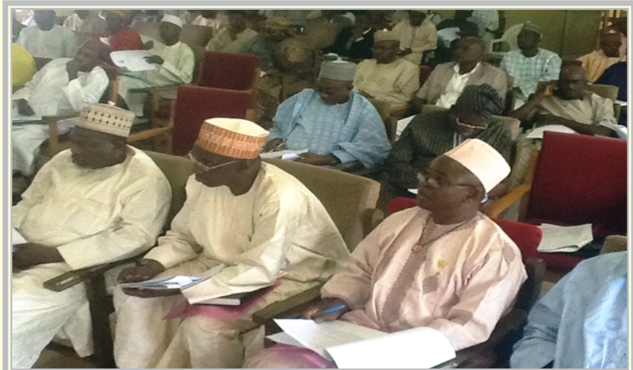
Cross section of Participants at Service Charter Workshop

At the end of the Workshop, the Kaduna State Service Charter Policy and Guideline was validated.